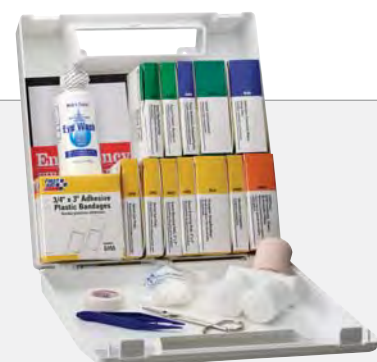
Item 0802 - $60

Meets federal OSHA standards and ANSI recommendations*. Great for offices, vehicles and work sites.