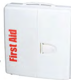
Item 0700 - $99 General Workplace Cabinet

Choose our Workplace Cabinet or pick a Food Service unit.