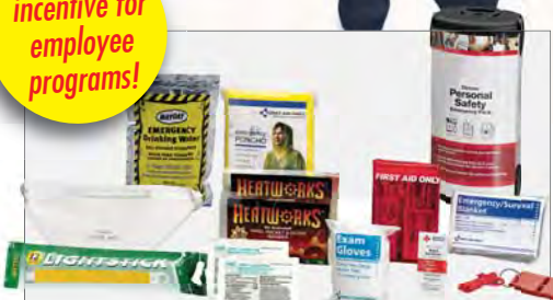
Item 0900 - $24