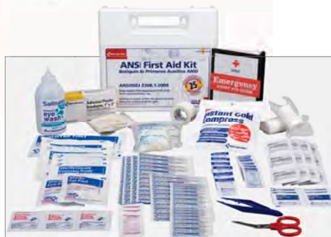
Item 0801 - $35

Every employee should be prepared with this cost-effective emergency pack.