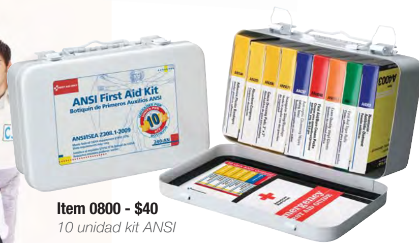
Item 0800 - $40 10 unidad kit ANSI